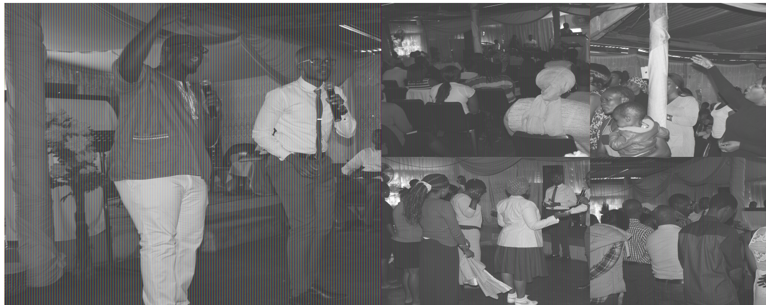
The Lord is My Shepherd Church, Marapong