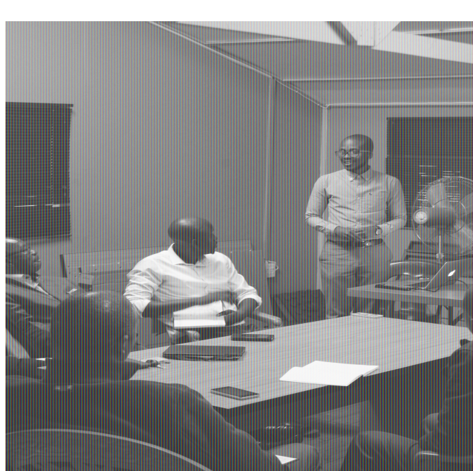
Meeting With Pastors of Marapong