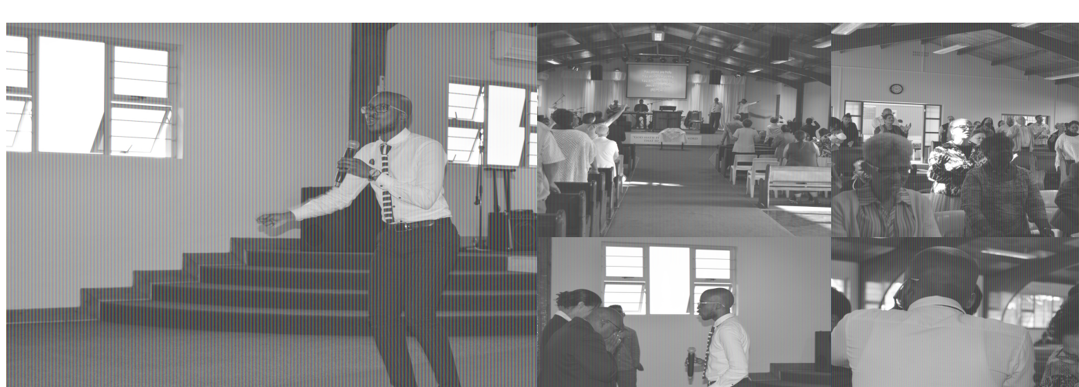
Open Door Assembly, Durban