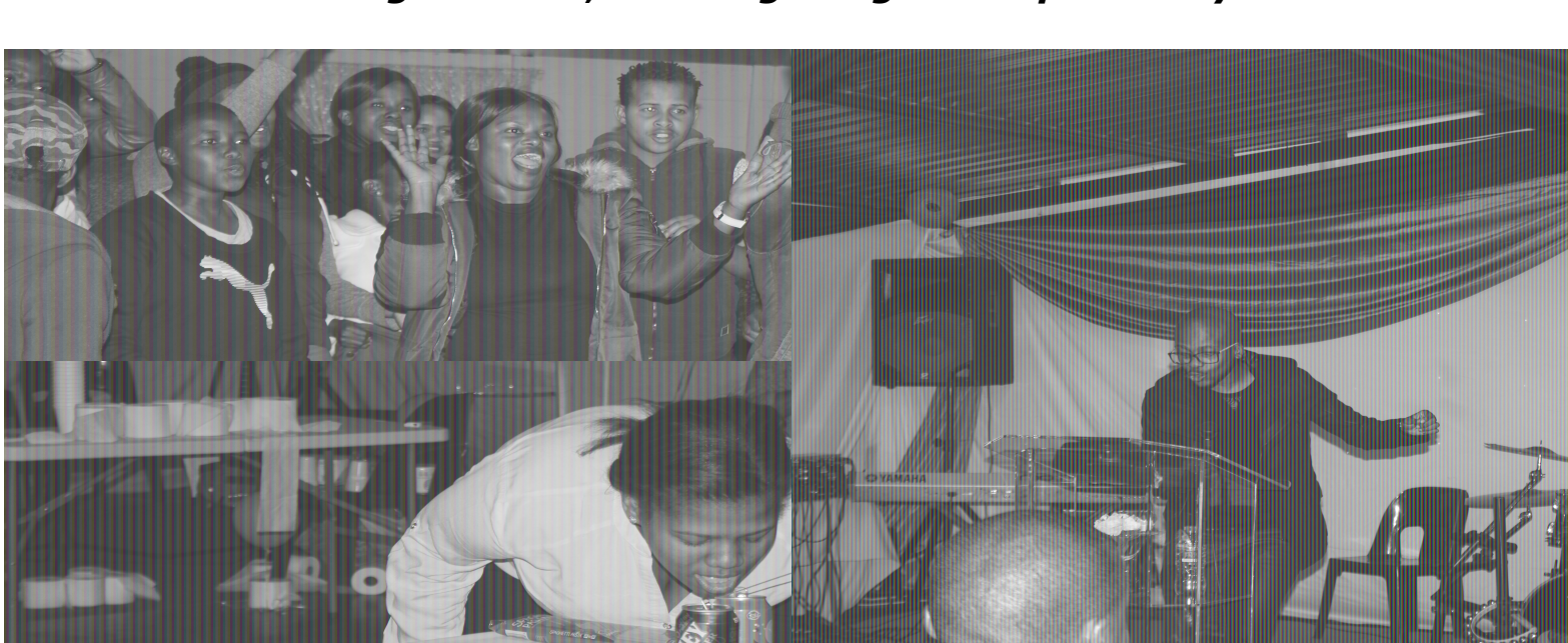
His Dwelling Place Church, Marapong